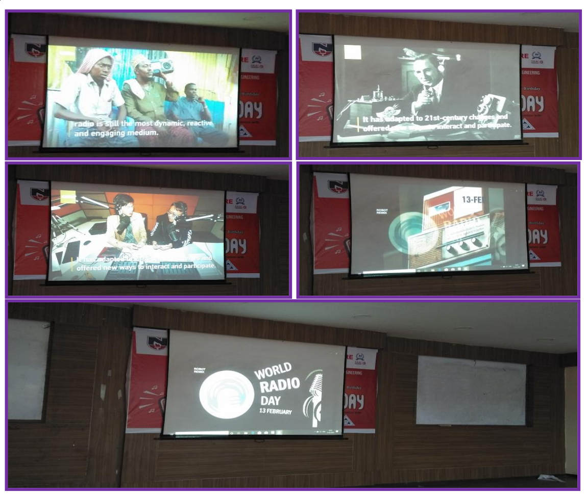
Fig: Some of the highlights from Videos (World Radio Day)

During its 67th Session, the UN General Assembly adopted a resolution on January 14, 2013, the United Nations General Assembly formally endorsed UNESCO's proclamation February 13 as World Radio Day.